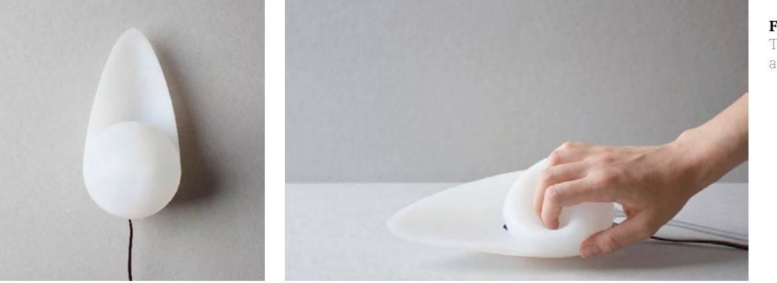
Fig. 10. and 11. The device in a deflated state.

Although going to bed without gadgets does not seem like an option to many of us, when we funnel all of our attention and personal time elsewhere, we devalue the direct, unmediated experience of the place we find ourselves in. If our collective desires are these of intimacy and connection, we may come to realize that being at peace with one's unplugged self is key for more fulfilling personal relationships with our loved ones and our community. In addition, personal relationships with close friends, partners, and family members are sustained by meanings that cannot, or do not have to, be always explicitly expressed; it is a common ground that does not have to be put into words to exist. This kind of meaning, the one that already dwells within people, is implicitly conveyed in their mindful presence – even when performed asynchronously and from a distance. Z-shell introduces a practice of introspection for revisiting and cultivating shared meaning.