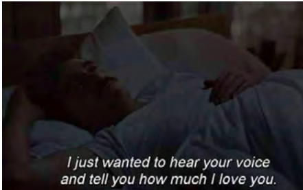
Fig. 8. and 9. Stills from Her (2014), directed by Spike Jonze. In this scene, the protagonist is woken up by Samantha. She is an advanced operating system.