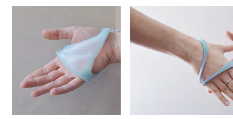
Fig. 5. and 6. (left) Meetspace in an inflated state. (right) Before the handshake, the wearables deflate each other to make room for the stranger's hand.

Meetspace intends to act as an ice-breaker for spontaneous, one-onone social encounters which are often intimidating to initiate with complete strangers. In this light, Meetspace aims to become a conversation starter, updating our code of conduct accordingly. However, whether a conversation will eventually happen or not is entirely up to the people involved. Will they grab the opportunity to meet someone with a radically different background and outlook on life – to whom they would probably never have been exposed within their 'filter bubble'? Is the prospect of an unpredictable, open-ended conversation intriguing enough to make people leave their comfort zone in public space?