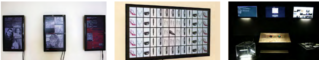
Fig. 1. a) Shell performance, b) Shopimation, c) DEL?No, wait!REW.

For the Art Meets Radical Openness (AMRO) festivals’ exhibition selected participants from the ArtLab and the Behind the smart world publication were invited to present their artistic case studies. The exhibition was further curated through network meetings and an open-call resulting in artworks focusing on e- waste and data scraping being included in the exhibition. Throughout the festival weekend, artists organized guided tours through the exhibition and workshops by the Tactical Technology collective and a data funeral performance by Audrey Samson completed the program. In the following paragraphs we want to focus on several artistic case studies that deal with the recovered data and showcase results of the ArtLab.